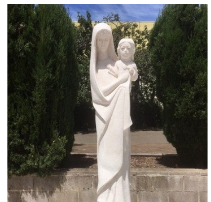
Our Lady of the Sacred Heart (Statue at Chevalier College)