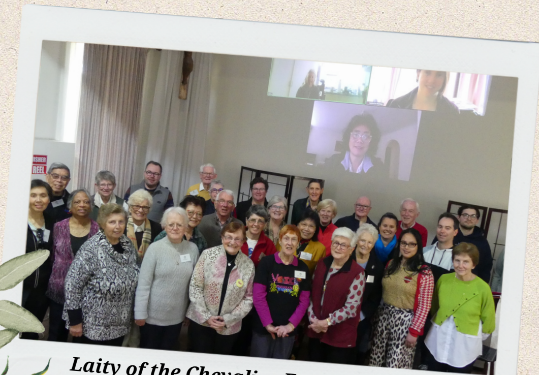
Laity of the Chevalier Family Australia National Gathering 2023

It was a weekend of meeting and enjoying the company of new people, of singing, sharing, and praying together as LCF members, all united in a desire to continue the charism and spirit of Fr Chevalier: to be on earth the Heart of God.